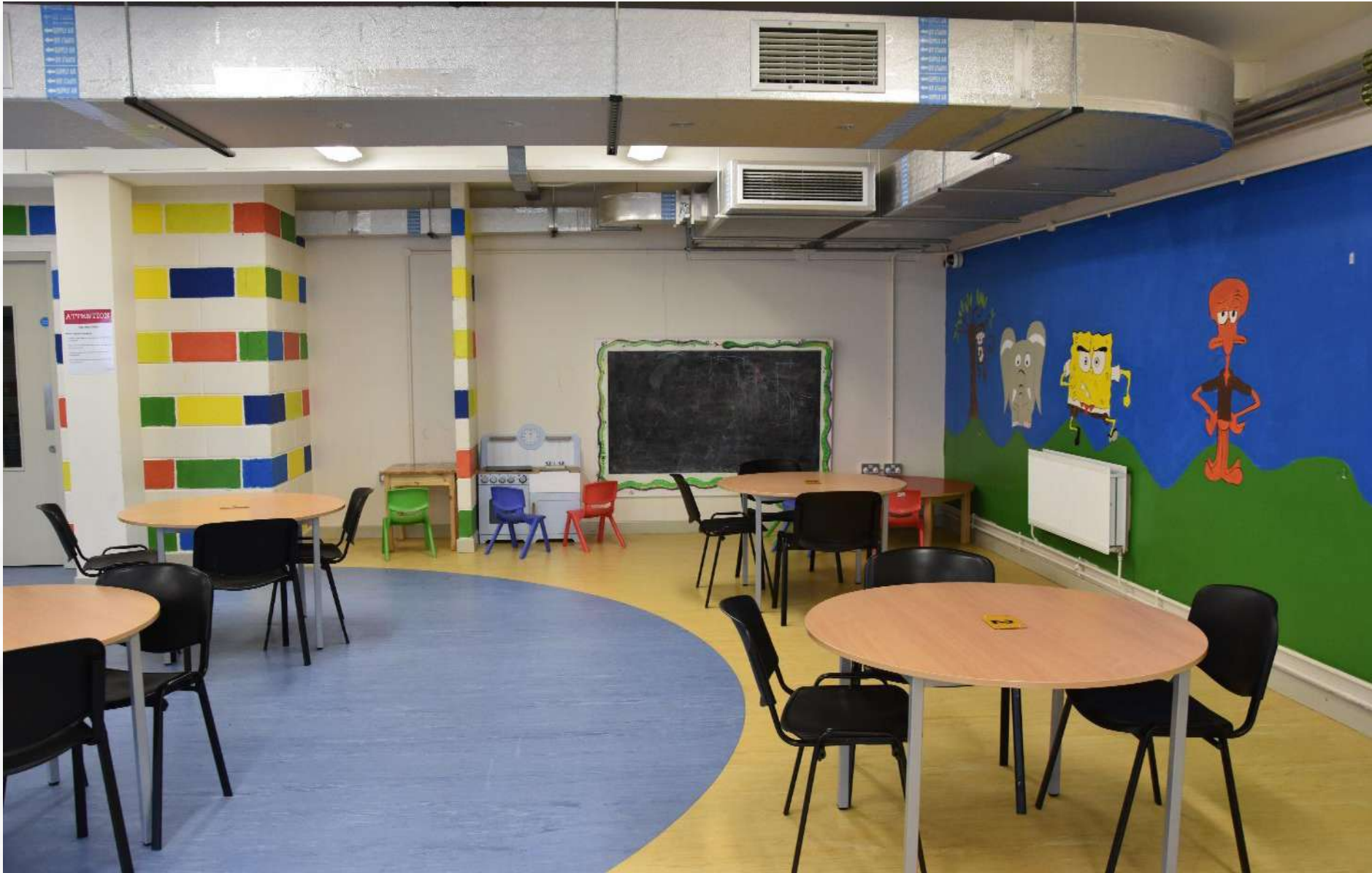
Limerick Prison. Irish Prison Service