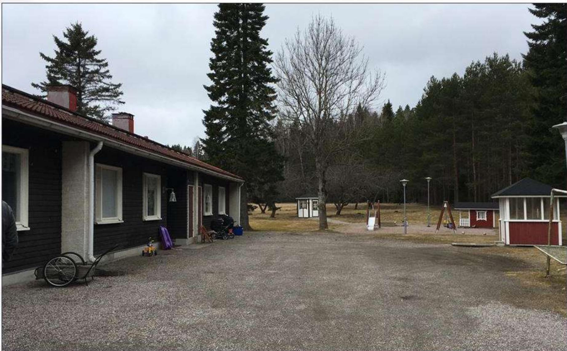
Unitats Mixtes Familiars a Vanaja Open Prison Criminal Sanctions Agency RISE. Finland