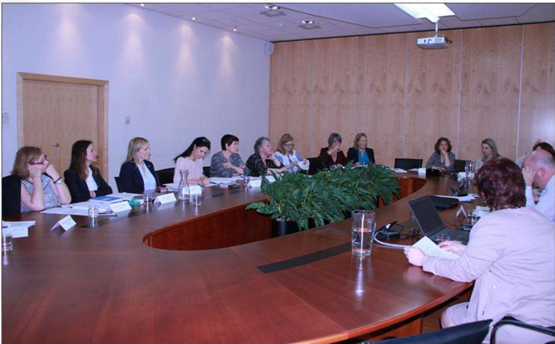
Primera Sessió de Treball. Ministry of Justice: Croatia Prison Administration