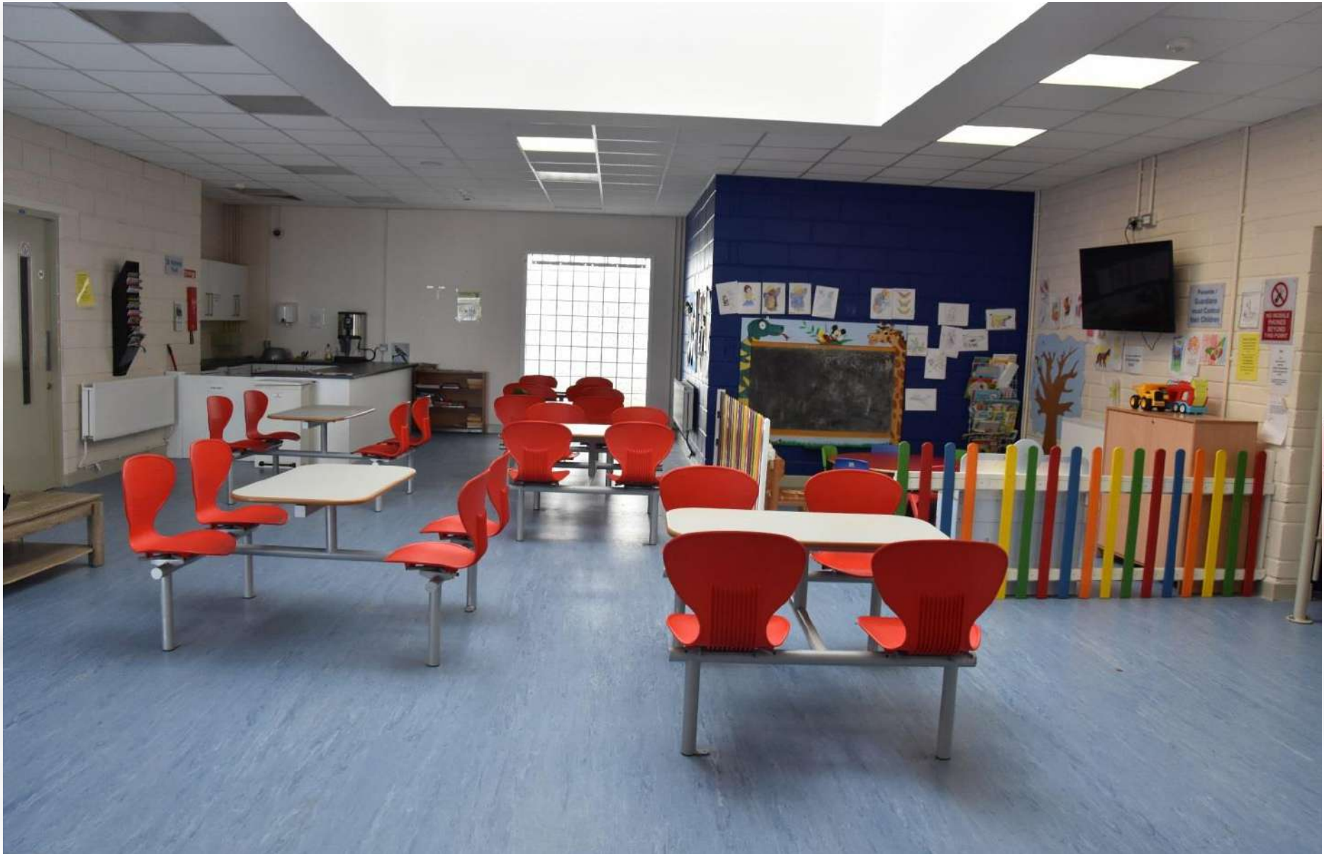
Limerick Prison. Irish Prison Service